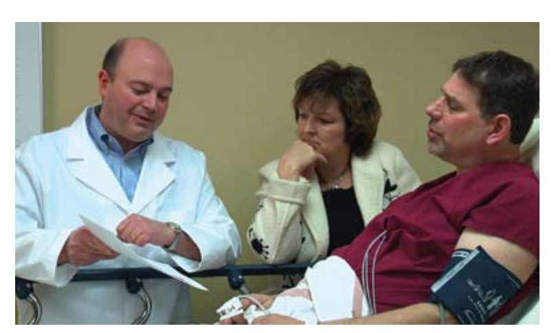
To evaluate minor rectal bleeding, your doctor may perform a digital rectal examination. In addition, an endoscopic procedure such as anoscopy, flexible sigmoidoscopy or colonoscopy may be recommended.

Hemorrhoids (also called piles) are swollen blood vessels in the anus and rectum that become engorged from increased pressure, similar to what occurs in varicose veins in the legs. Hemorrhoids can either be internal (inside the anus) or external (under the skin around the anus). Hemorrhoids are the most common cause of minor rectal bleeding, and are typically not associated with pain. Bleeding from hemorrhoids is usually associated with bowel movements, or it may also stain